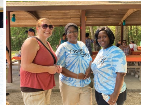
Open Sky staff at a team picnic

“At Open Sky, our unwavering commitment is to create an organization that genuinely embraces and cherishes everyone, fostering an inclusive environment where both our dedicated employees and the people we serve find a deep sense of worthiness and belonging, regardless of their unique identities.”