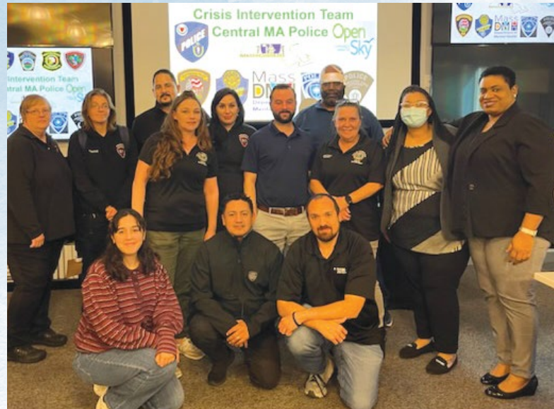
Graduating class of a CIT Dispatch Training including staff from the Worcester Emergency Communications Center.