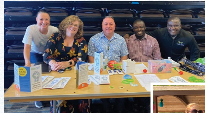
Committee Advancing Racial Equity (CARE) Team members at the agency's health fair in 2022

“Open Sky Community Services is committed to becoming anti-racist, celebrating diversity and creating an environment that provides a safe, inclusive and equitable space for all by fostering growth and healing. We will create, promote and uphold policies, practices, attitudes and actions that create unbiased power and access to opportunities for our community.”